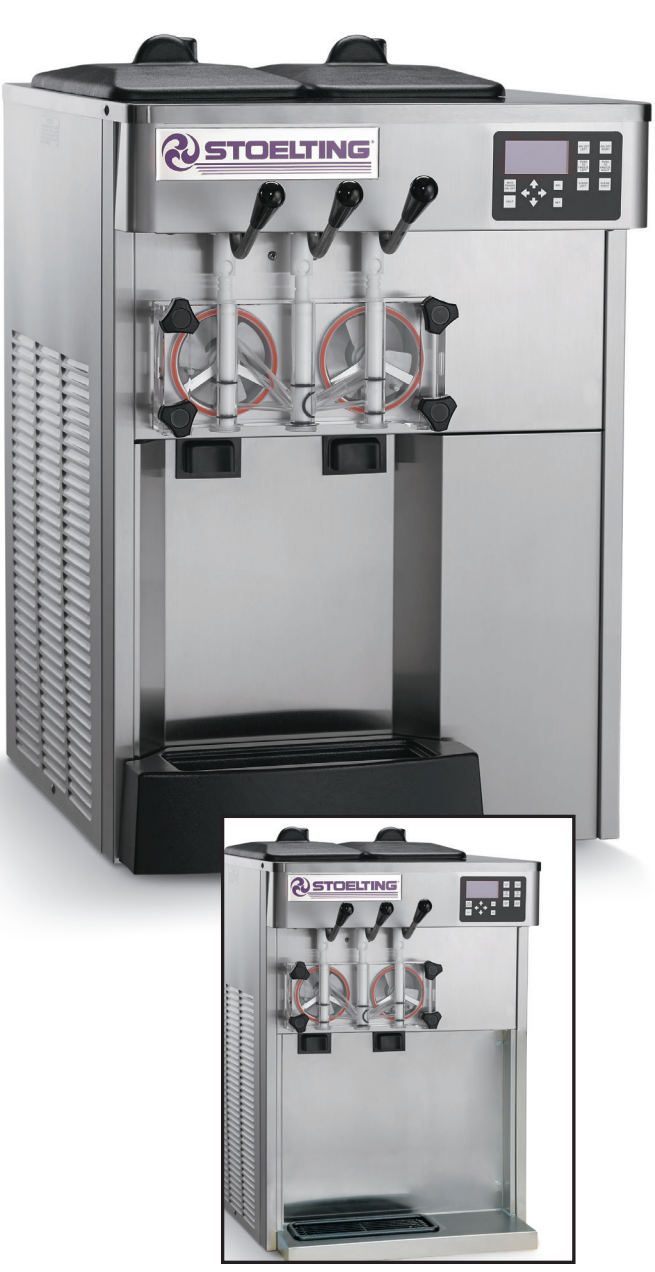
Modified Design for Frozen Yogurt Installations